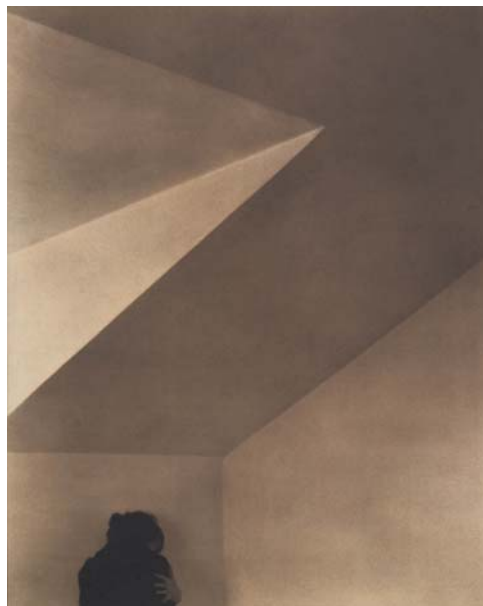
Pictured above: Edward Weston's The Ascent of Attic Angles , 1921 (est. $700,000/1 million)